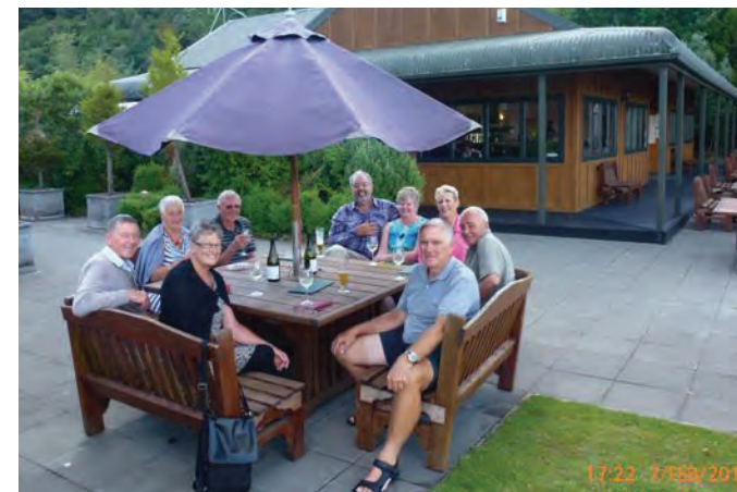
A gathering for dinner at Lakeland House, Waihi of the helpers involved in the Casting for Recovery retreat.