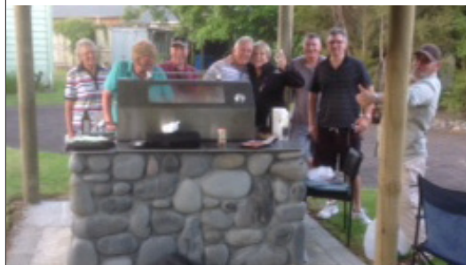
Aucklanders, Wellingtonians and Hawkes Bay members enjoying a joint meal- Boxing Day